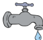
not much water